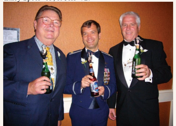
OSB Brats buy the guy a Beer! What's that on top of those bottles???