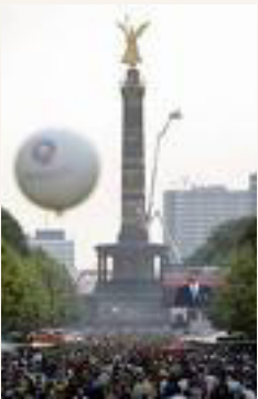
BERLIN July 24, 2008