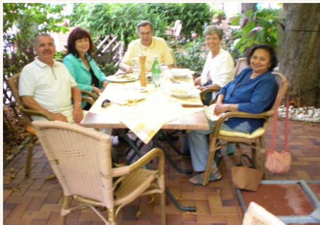
Berlin Teachers meet in Dahlemdorf for Lunch

It was a great time together at an Italian restaurant in Dahlemdorf.