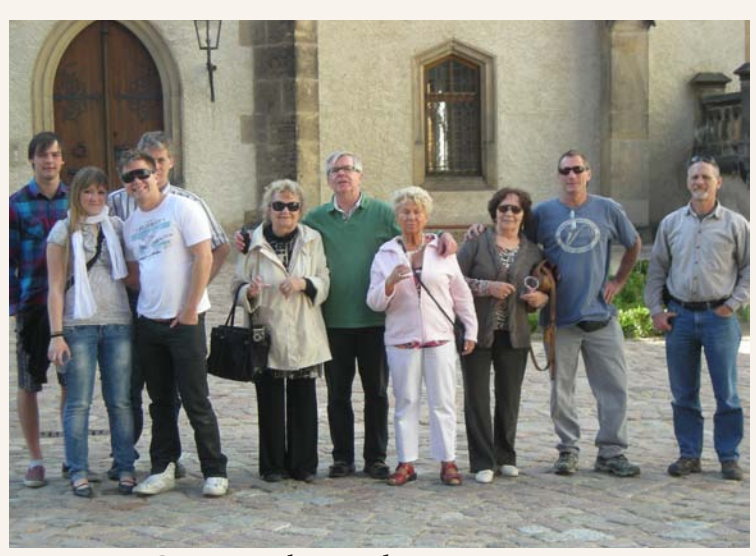
East German relatives during our trip in 2011