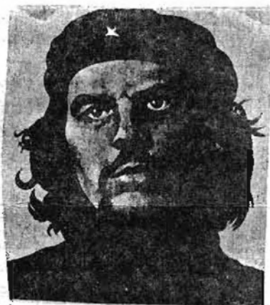
Revolutionary Junior High student opposes lunchroom seating system.