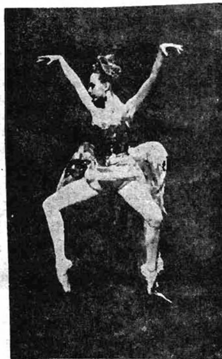
Economics student leaps for joy, crying, "The market's up!"