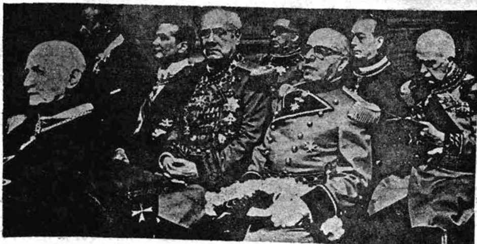
BAHS staff meeting.