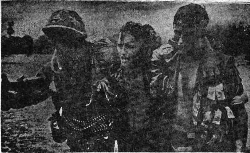
Tired Cubs come off the field after the Baumholder game.