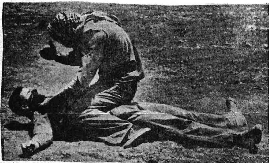
"Encounter" session in Drug Workshop class.