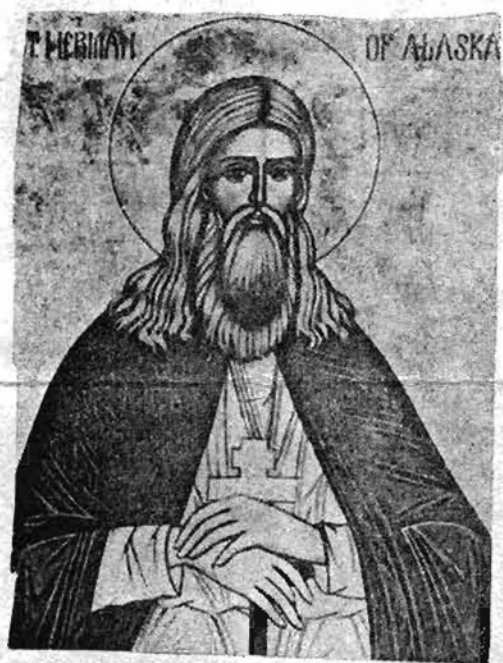
Work of art to be donated by the senior class for the front hall display case.