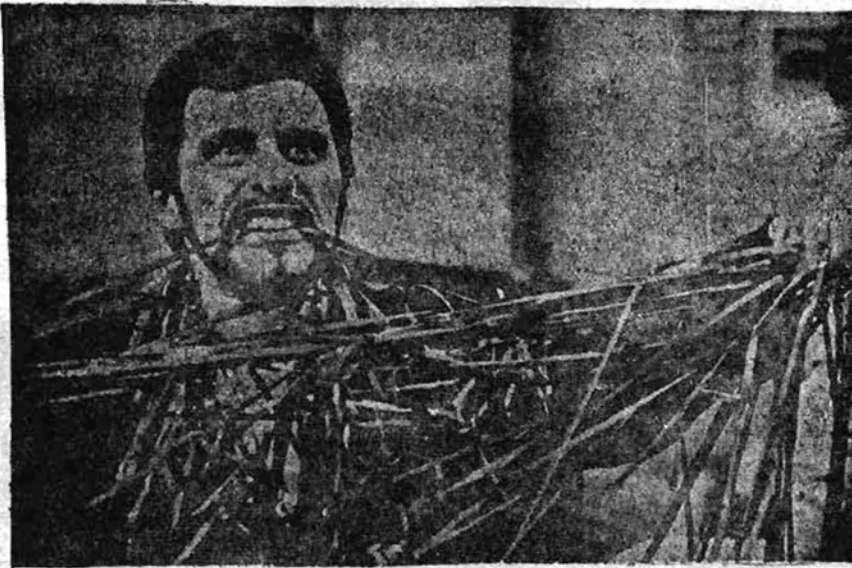
A satisfied customer at the senior spaghetti dinner.

Berlin American High School March 29, 1972