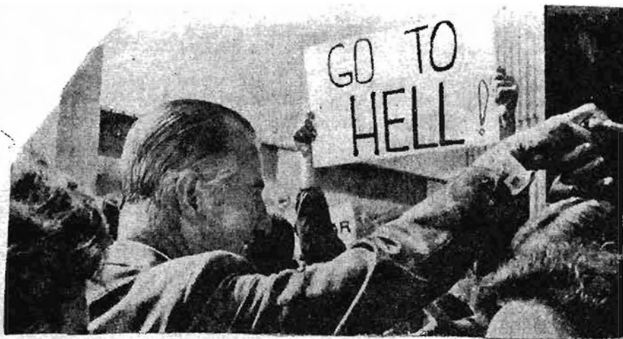
Distinguished visitor receives warm reception from BAHS students.