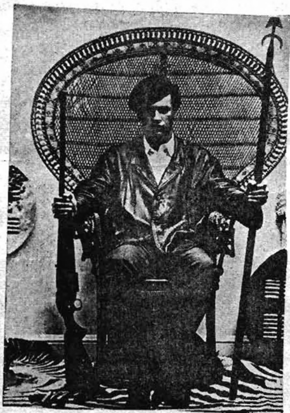
Former Senior hall guard. "They shall not enter before 8:20!"