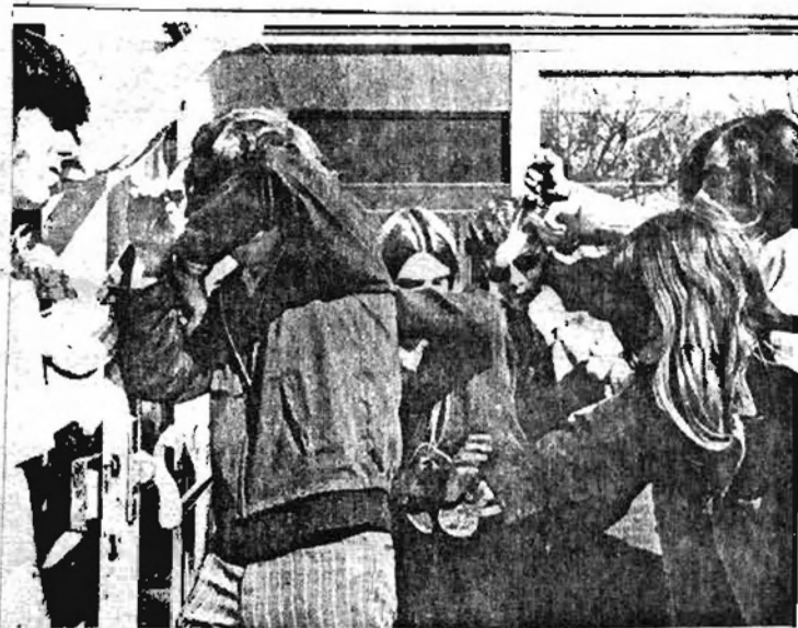
Bull Sheet staff leaves school after distribution of last issue.