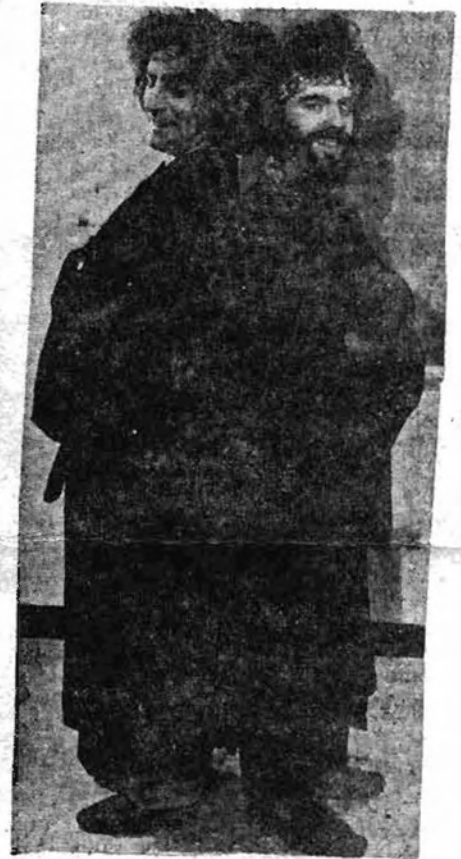
New NHS Inductees