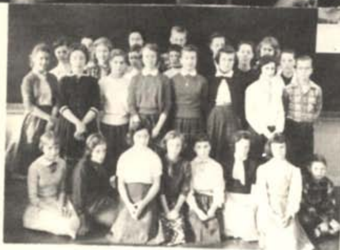
Newspaper Staff Stamp Club