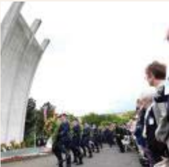
Wreaths being placed at the Airlift Memorial - Tempelhof

May 12, 2014 marked the 65th anniversary of the end of the Berlin Airlift, and 54 retired U.S. Air Force veterans who participated in the Airlift – pilots, navigators, engineers, crew chiefs, maintenance men, radio repair men, supply men – and their families came to Berlin to celebrate this anniversary.