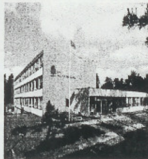
Berlin American High School